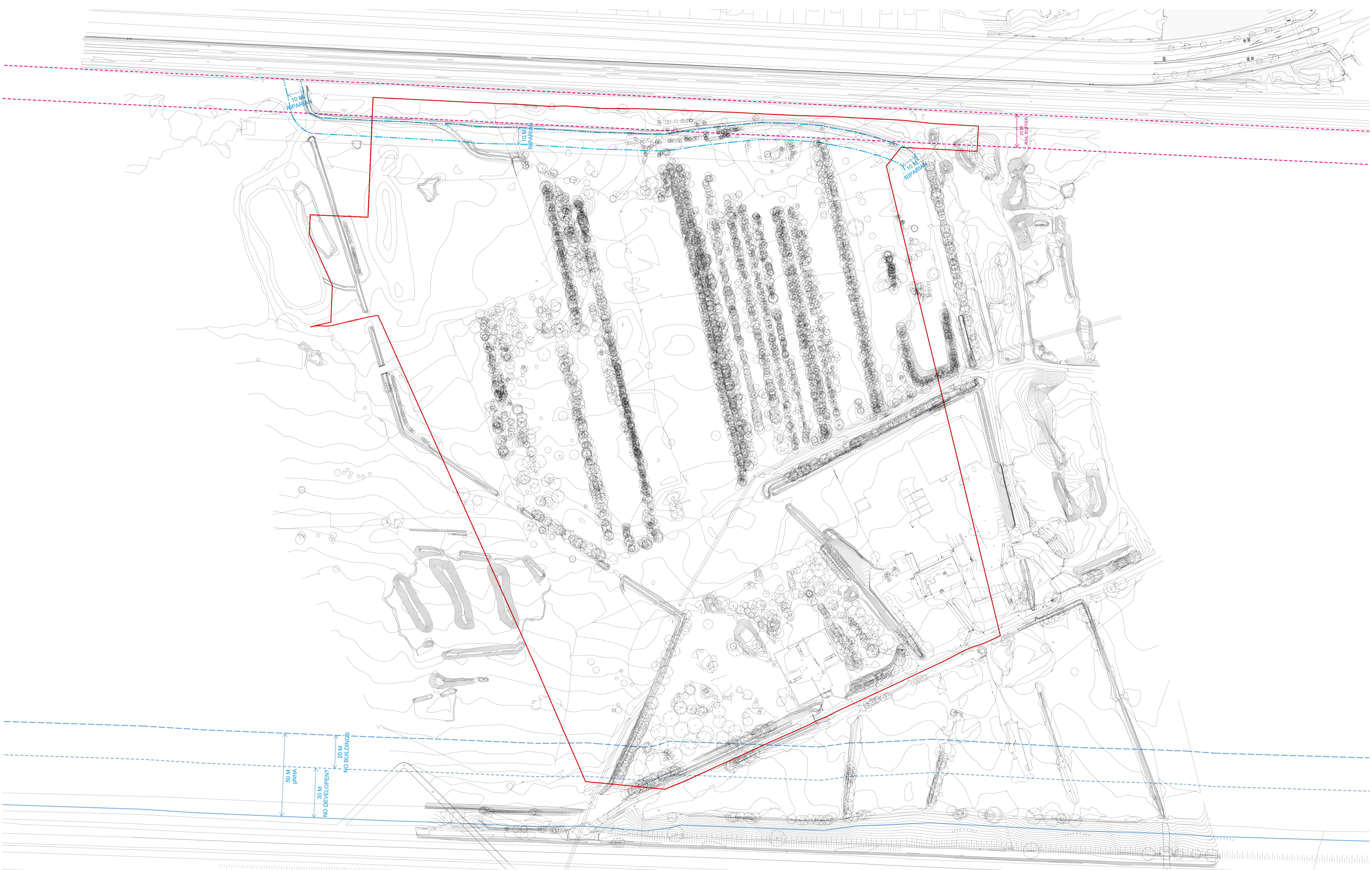
EXISTING SITE SURVEY 1:1000 @ A1

GENERAL NOTES: DRAWING TO BE READ WITH REFERENCE TO THE FOLLOWING ASSOCIATED DRAWINGS AND INFORMATION: - 0000 SERIES DRAWINGS: EXISTING SITE INFO. - 4000 SERIES DRAWINGS: GA DRAWINGS/ UNIT TYPES INFO. - 1000 SERIES DRAWINGS: PROPOSED SITE LAYOUT INFO. - 5000 SERIES DRAWINGS: PROPOSED MATERIALITY - 2000 SERIES DRAWINGS: PROPOSED ELEVATIONS INFO. - 6000 SERIES DRAWINGS: HQA AND ASSOCIATED SCHEDULE OF INFO - 3000 SERIES DRAWINGS: PROPOSED SITE LONGITUDINAL SECTIONS - ARCHITECTURAL DESIGN STATEMENT